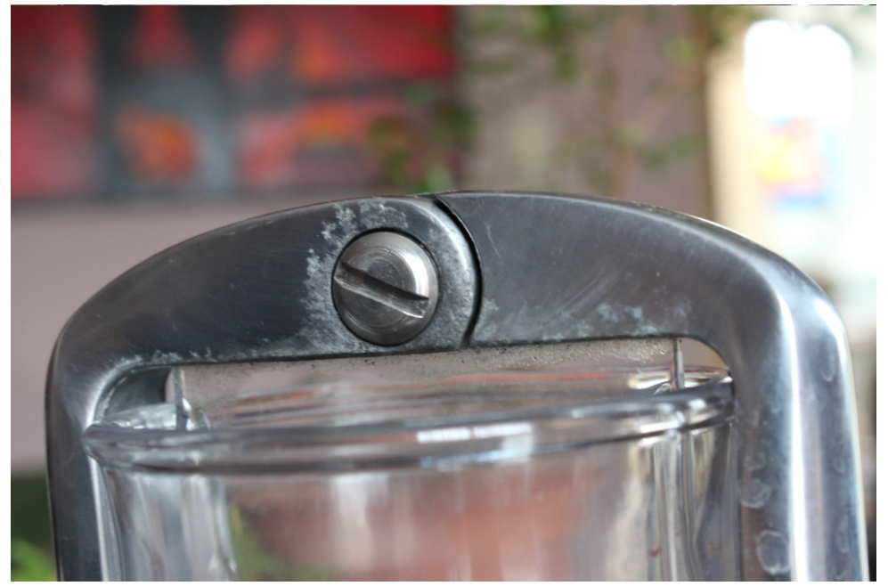
(https://artofolivegreen.files.wordpress.com/2013/03/img_2060.jpg) Galvanic corrosion around the joint.

Another flaw, this one more serious, is the choice of ridiculous rubber feet that stick to the bottom. As a metalworker, I can tell you that anodized aluminum is an amazing material. Almost anything (paint, adhesives etc.) will stick to it, much better than it would to raw aluminum. After anodizing and painting aluminum, it can be sealed to prevent anything sticking. So if the base were aluminum, I would have anodized it, stuck the feet on, then sealed it.